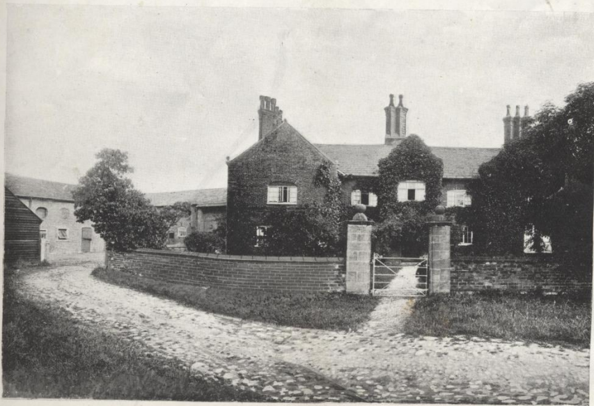
Dukinfield Hall. Lot 7.