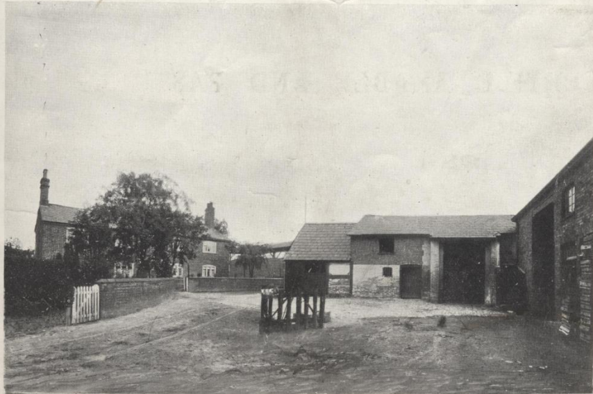
Town Lane Farm. Lot 2.