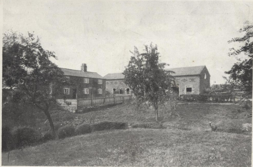
Oak Tree Farm. Lot 1.